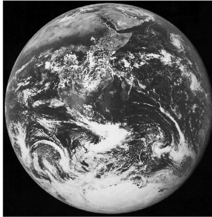
View of Africa and Saudi Arabia from Apollo 17.

The answer is no. The more you study any science, such as astronomy, the more you find that the universe is far from random. There